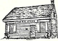
Ralston General Store 1781-1941