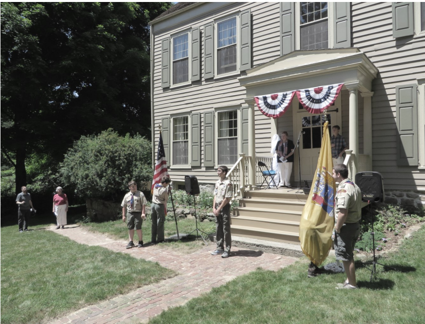
The Boy Scouts from Troop 1 in Mendham help open the 50 year celebration with the procession of the Color Guard.